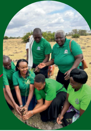
FRIENDS OF KIU CATCHMENT

It a non profit organization focused on environmental issues and well wishing